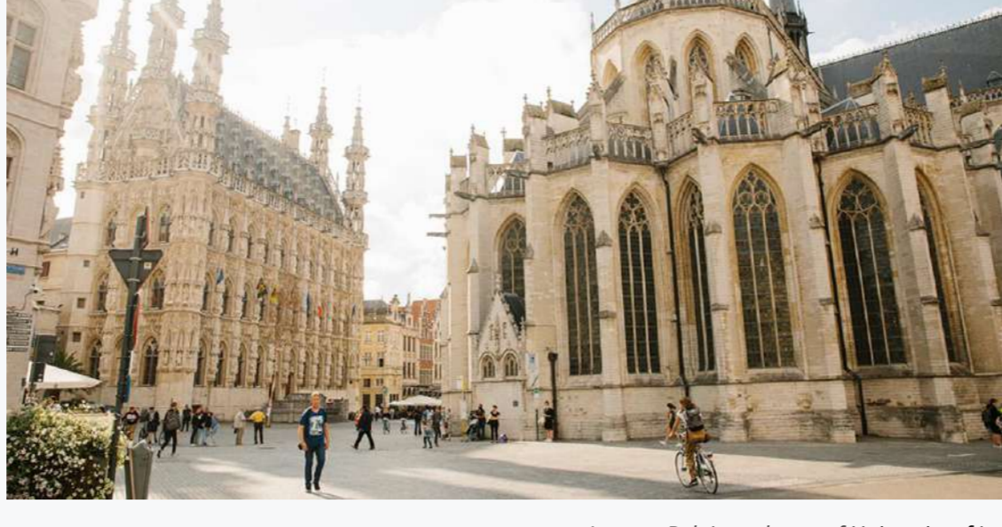
Leuven, Belgium - home of University of Leuven